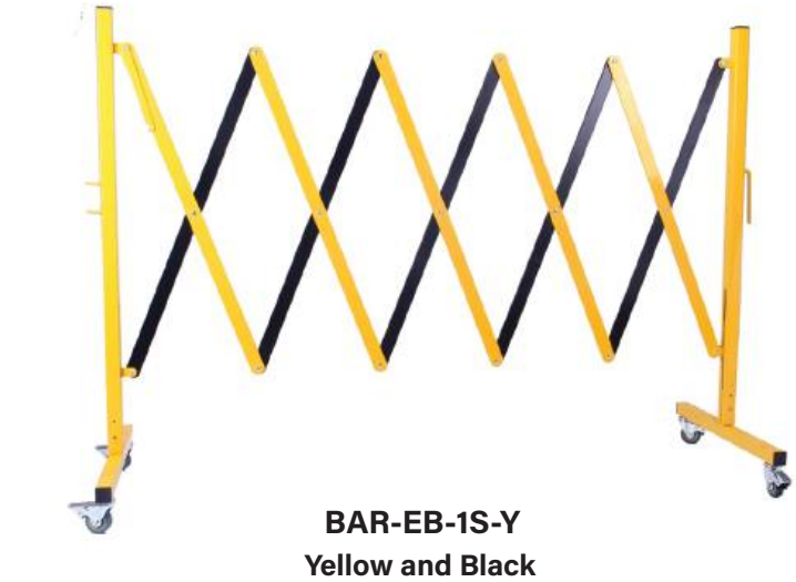
Yellow and Black Powder Coated Light Steel