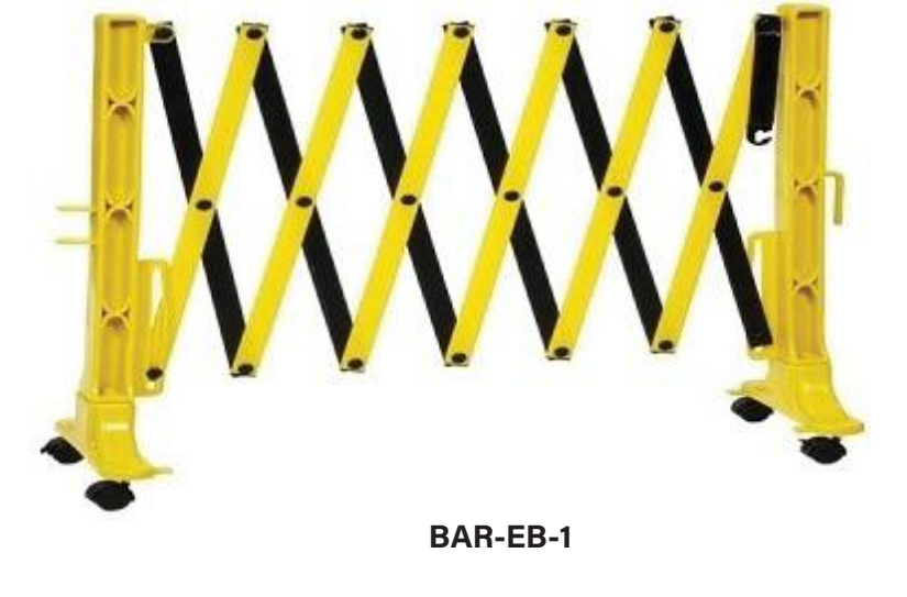
Compact for Storage!