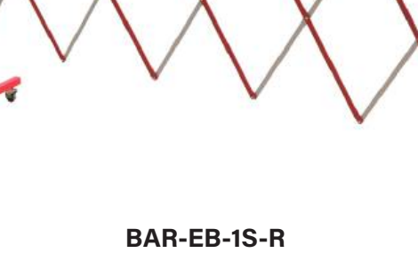
Red and White Powder Coated Light Steel